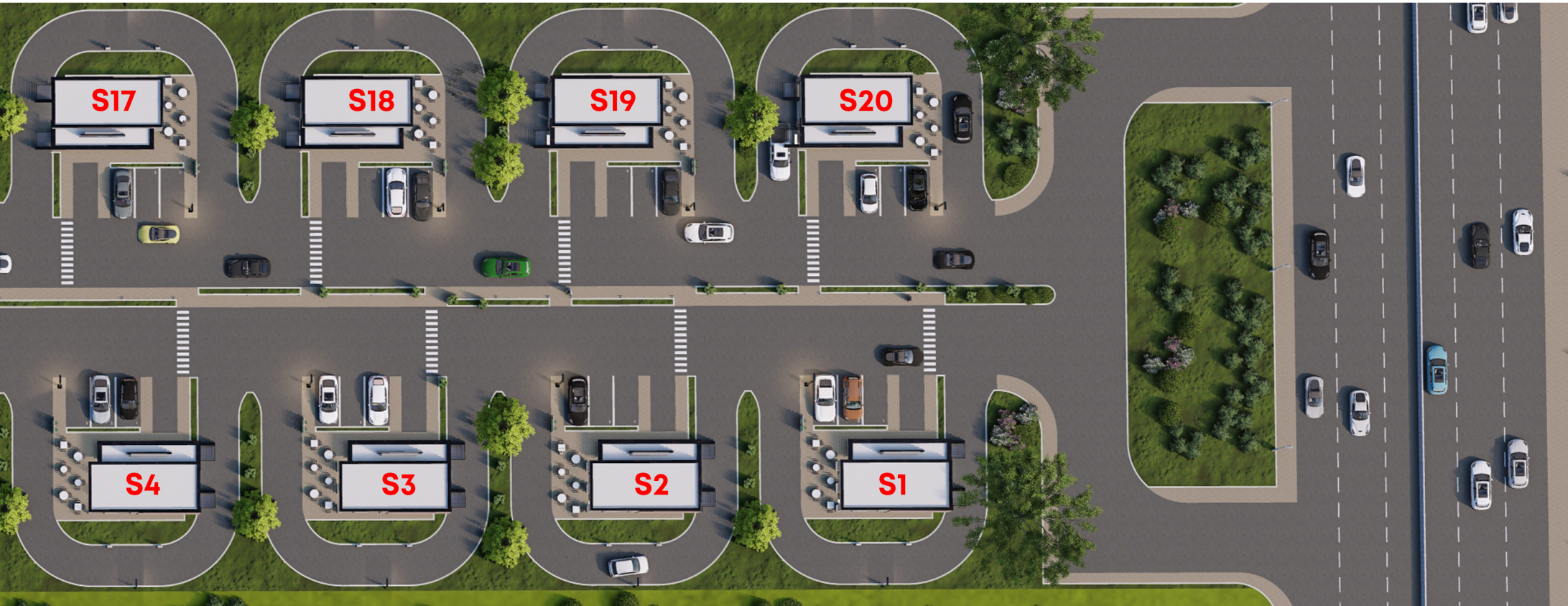
Bird's eye view over the units